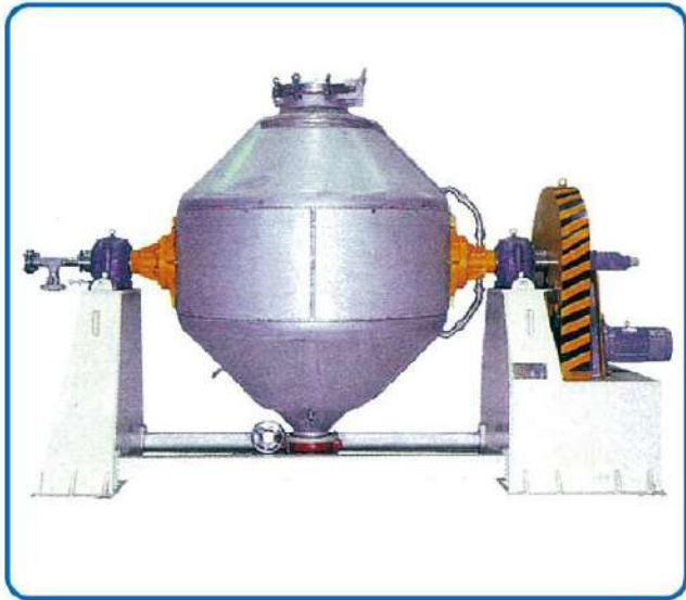
構造圖 (STRUCTURE DIAGRAM)